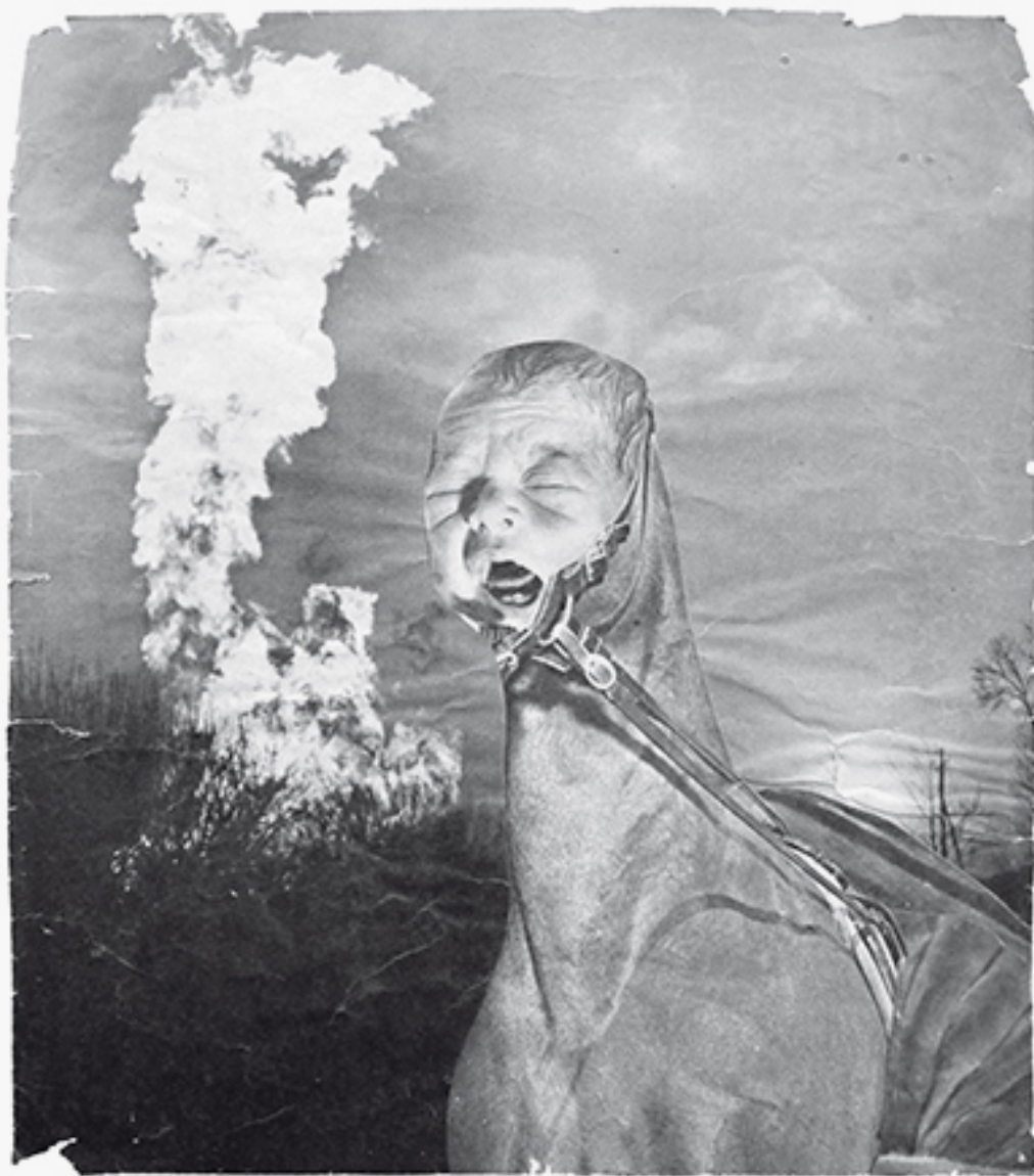
Salle 2 - Violence