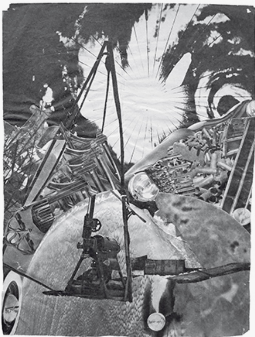
Salle 3 - Pouvoir Profit